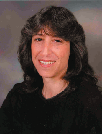
Audrey Silk NYC Mayor